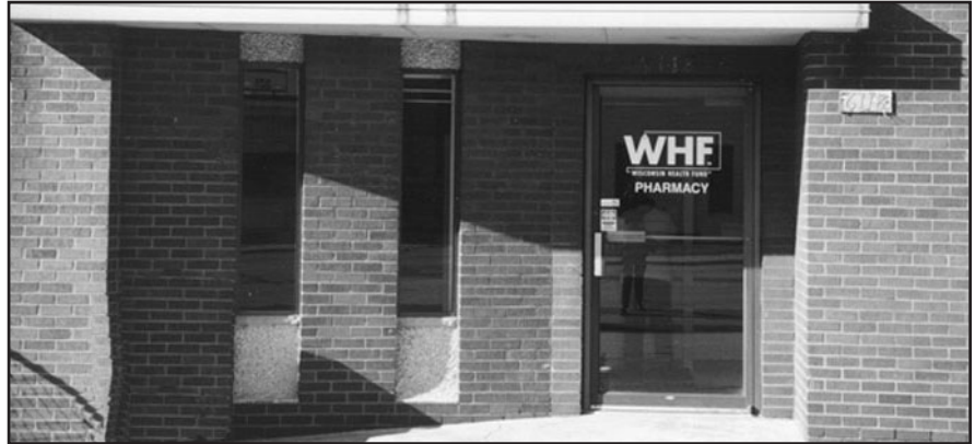
The WHF Clinic Pharmacy is conveniently located one-half block east of the WHF Medical/Dental Center at 6118 W. Bluemound Road in Milwaukee. (See map on page 6)