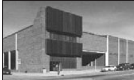
The WHF Medical Center is conveniently located at 6200 W. Bluemound Rd. In Milwaukee. Bluemound Rd. is one half mile north of I-94.