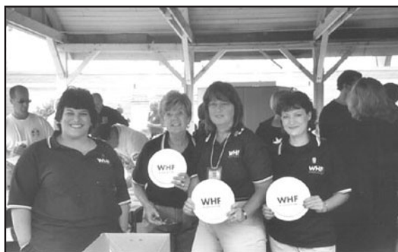
WHF participated at LaborFest 2003 at the Summerfest grounds on Labor Day.